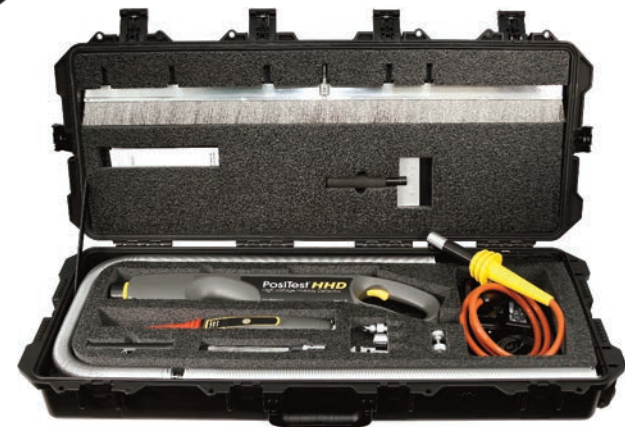
PosiTest HHD shown with optional electrodes and accessories

For a complete list of available electrodes visit www.defelsko.com/hhd