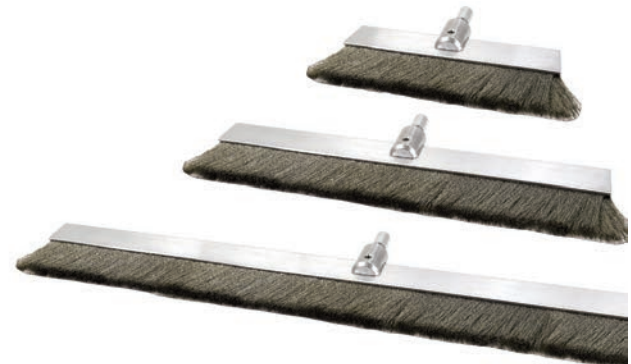
Flat Wire Brush Electrodes