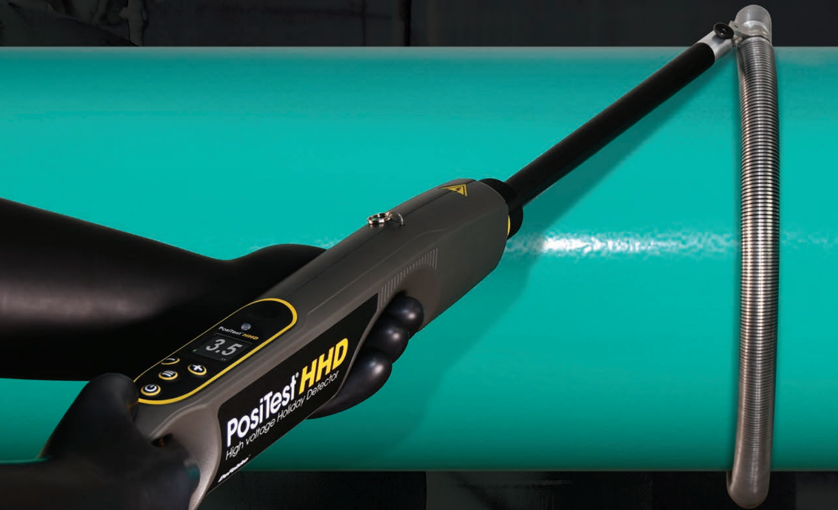
Optional handheld wand with insulated cable

Detects holidays, pinholes and other discontinuities using pulse DC