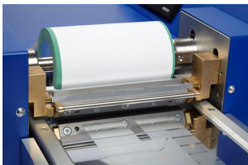
Below: Detail of the GP100 in use

High quality proofs using gravure inks of press viscosity are produced instantly using the new GP100. Featuring a microprocessor controlled servo drive and pneumatic operation, electronically engraved printing plates and variable printing speeds of 1 to 100m/min, this is an essential tool for all those involved in the manufacturing or use of liquid inks. Ideal for R&D and computer colour matching data, quality control and presentation samples, the GP100 is very easy to clean.