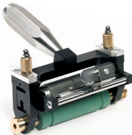
Esiproof Spring version