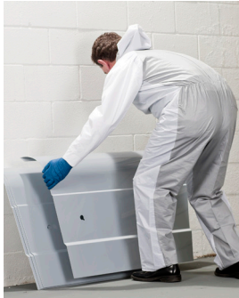
The Q-PANEL automotive refinish training system is a cost-effective simulation of hoods and fenders.

These custom panels are most cost-effective when there are quantities sufficient to allow an economical production run, and when the material is available from our stock metal or readily available alloys. Contact Q-Lab with your custom panel specifications now!