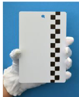
A variety of different pre-painted, patterned and other custom panels can be made upon request.