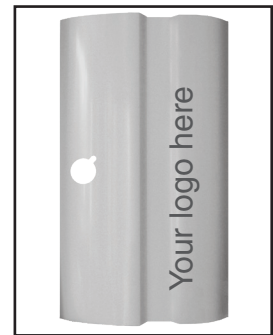
Panels can be customized in dozens of different ways, such as adding your company's logo.